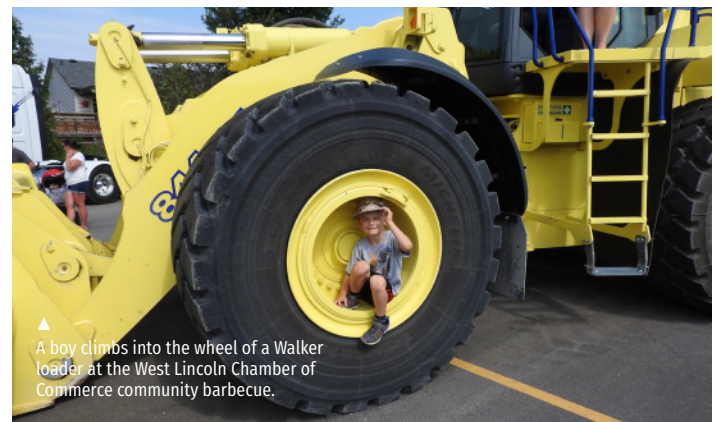
A boy climbs into the wheel of a Walker loader at the West Lincoln Chamber of Commerce community barbecue.

Also, out in the community, Vineland employees made many children smile at the annual West Lincoln Chamber of Commerce barbecue. Little and big kids alike got the chance to touch-a-truck and sit in some of our equipment while enjoying free food, jumping in bouncy castles and watching a magic show.