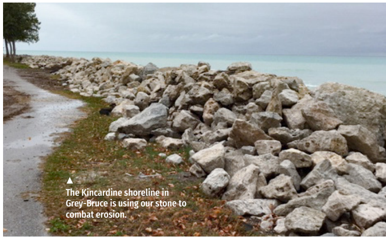
▲ The Kincardine shoreline in Grey-Bruce is using our stone to combat erosion.