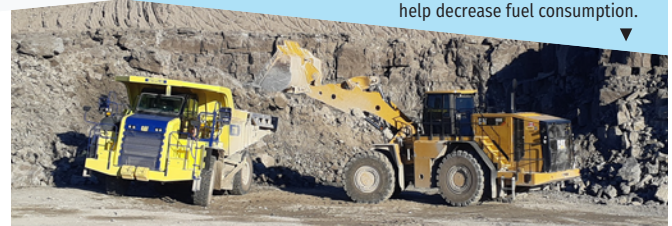
Vineland's new CAT 988K XE will help decrease fuel consumption. ▼