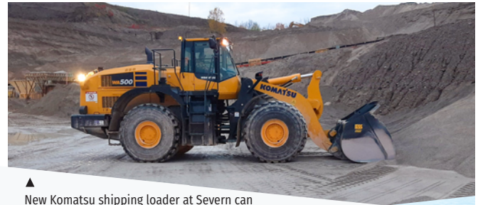
▲ New Komatsu shipping loader at Severn can handle a larger workload than its predecessor.

Severn Quarry replaced a small loader with a new Komatsu shipping loader with a larger bucket capacity that requires making less trips to move stone. The site has also installed new LED lighting to reduce energy consumption on-site. In addition, Severn has increased traffic control efforts to continue to keep neighbours safe as trucks enter and exit the quarry.