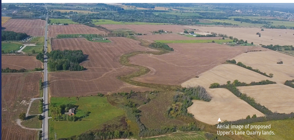
Aerial image of proposed Upper's Lane Quarry lands.

Information regarding the proposed Upper's Lane Quarry project including its location and the application process can be found on the project website: uppersquarry.ca .