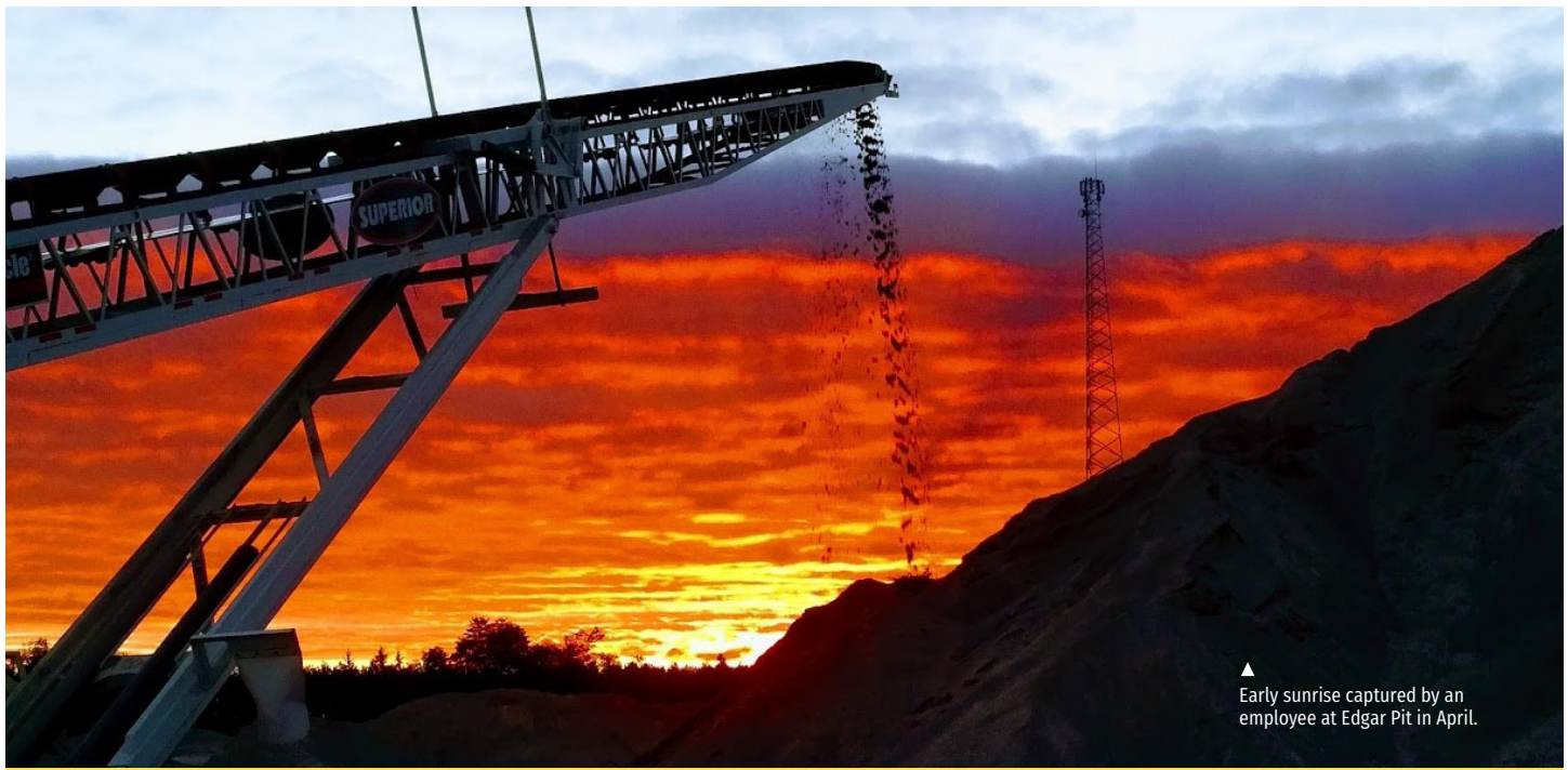
▲ Early sunrise captured by an employee at Edgar Pit in April.