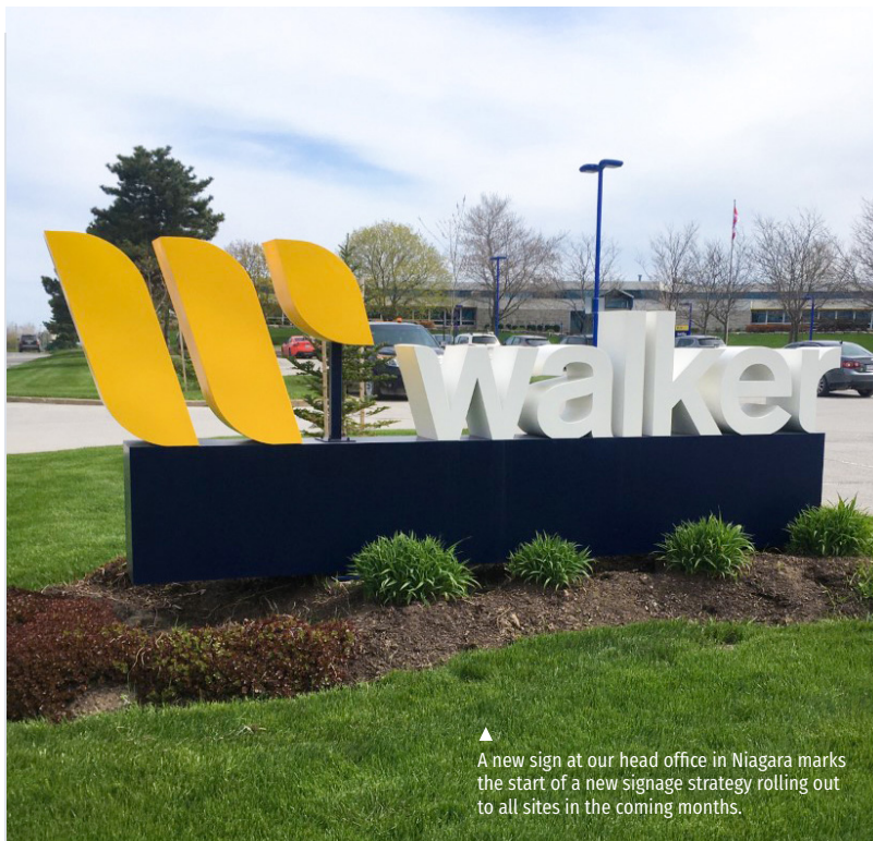
▲ A new sign at our head office in Niagara marks the start of a new signage strategy rolling out to all sites in the coming months.

To see the new logo and learn more information about Walker, visit our new website at: www.walkerind.com .