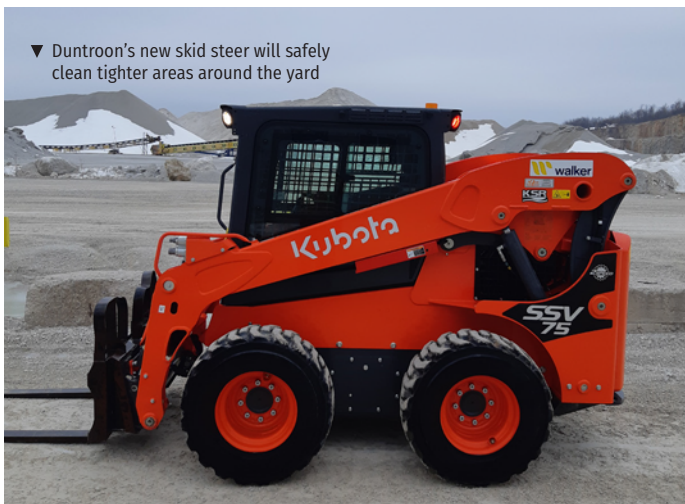
▼ Duntroon's new skid steer will safely clean tighter areas around the yard