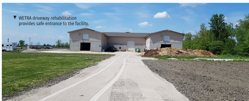
▼ WETRA driveway rehabilitation provides safe entrance to the facility.

More than 200 tonnes of stone from McGregor Quarry was donated to the Windsor-Essex Therapeutic Riding Association (WETRA) for driveway rehabilitation. WETRA was established in 1971 and provides a wide range of therapeutic programs including camp, group visits, therapeutic riding, and much more.