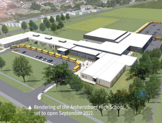
▲ Rendering of the Amherstburg High School set to open September 2022.