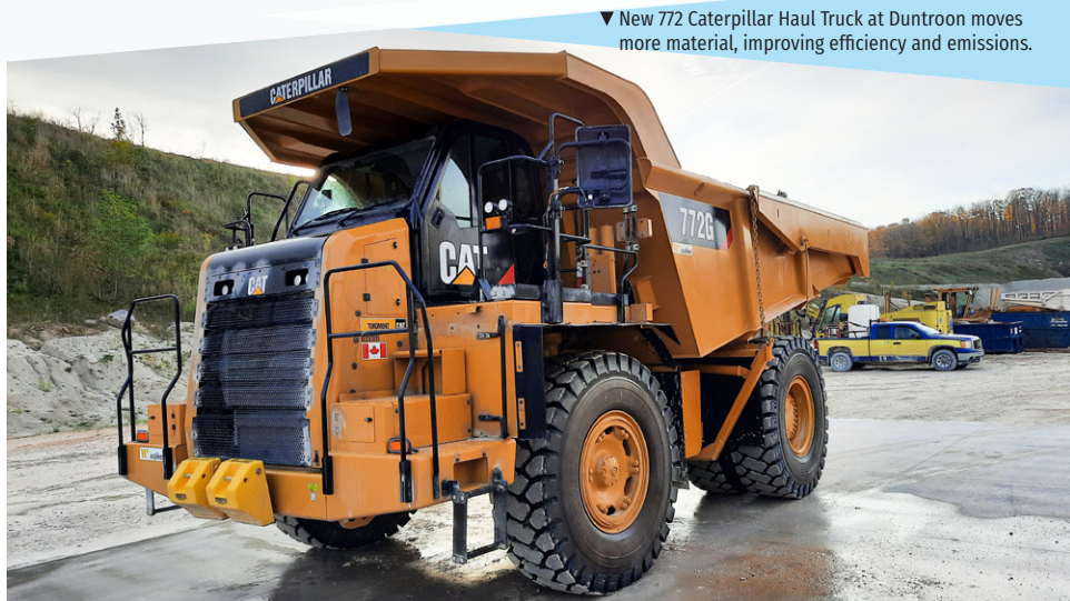
▼ New 772 Caterpillar Haul Truck at Duntroon moves more material, improving efficiency and emissions.