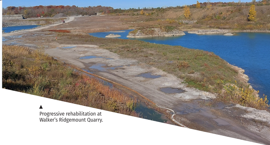
▲ Progressive rehabilitation at Walker's Ridgemount Quarry.

We also proactively protect wildlife as part of our rehabilitation efforts, like at Walker's Anten Mills site in