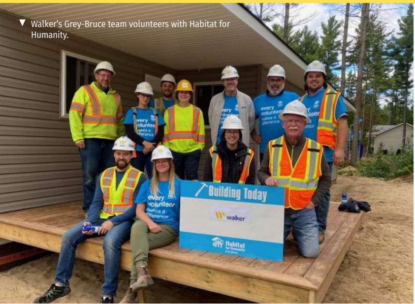
▼ Walker’s Grey-Bruce team volunteers with Habitat for Humanity.