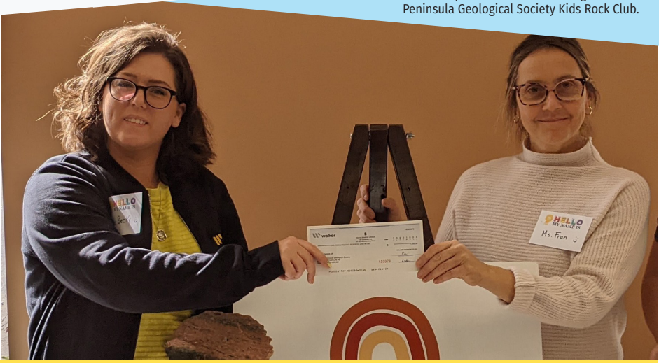
▼ Donation presentation to The Niagara Peninsula Geological Society Kids Rock Club.