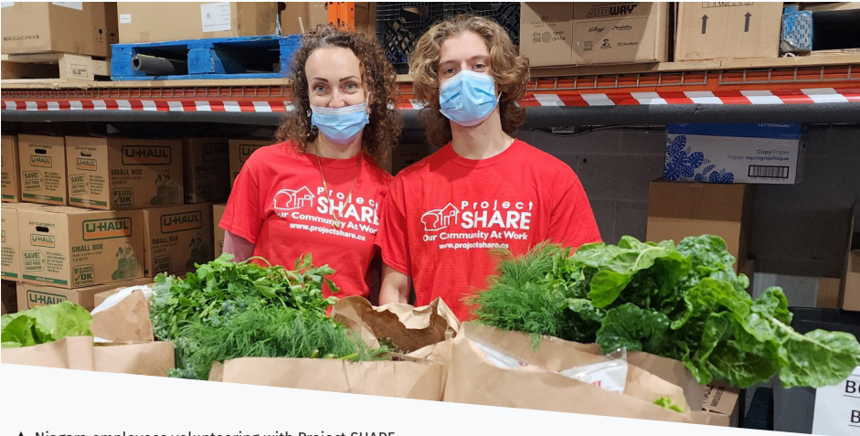
▲ Niagara employees volunteering with Project SHARE.