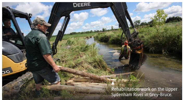
▲ Rehabilitation work on the Upper Sydenham River in Grey-Bruce.