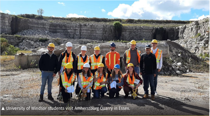
▲ University of Windsor students visit Amherstburg Quarry in Essex.

Third-year Environmental Sedimentology students from the University of Windsor took a tour of the Amherstburg Quarry; this tour and field exercise allows students to get firsthand exposure to different rocks and sediment and learn more about the industry and the importance of aggregates.