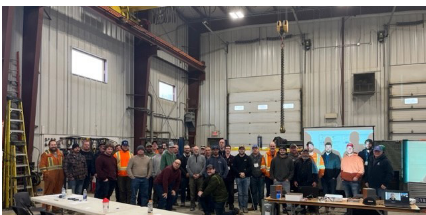
▲ Employees gather for spring start-ups to start the busy season on the right track.

Our Severn Quarry, Edgar Pit, and Orillia Pit 7 are supplying stone for the Burnside Line Overpass in Orillia. Severn Quarry stone is also being used for the 7th Line reconstruction project and Innis Village Subdivision in Innisfil.