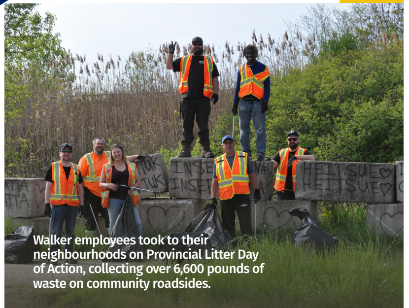
Walker employees took to their neighbourhoods on Provincial Litter Day of Action, collecting over 6,600 pounds of waste on community roadsides.