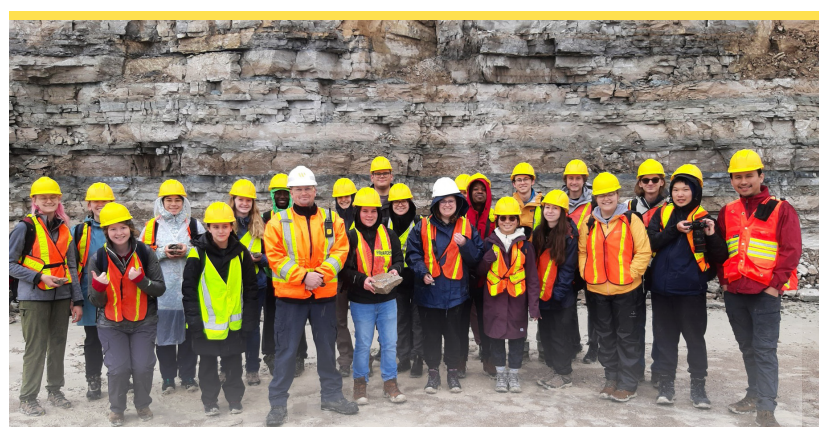
A group of students from McMaster University visited Severn Quarry for an educational tour.