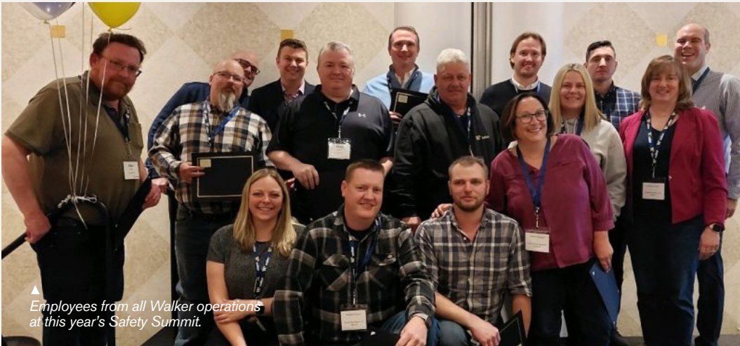
Employees from all Walker operations at this year's Safety Summit.

Walker encourages and facilitates continuous training and professional development. Employees can get financial assistance for training such as first aid and other operational certificates, and opportunities to join our Joint Health and Safety Committees (JHSC), which conduct frequent inspections and recommend further safety procedures. The committee is rotated every two years to allow more employees to grow and become safety advocates.