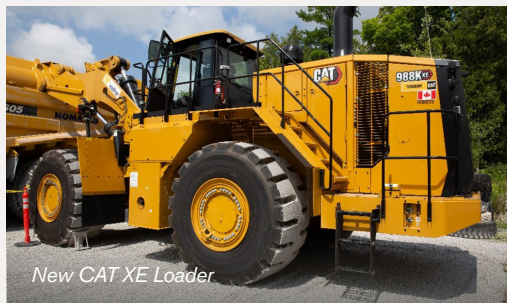
New CAT XE Loader

Three pits in Simcoe invested in new CAT XE loaders, which will enhance the team's ability to handle materials and perform jobs safely and efficiently. One of these machines alone will reduce fuel consumption by 25% compared to the regular model, resulting in substantial fuel savings and reduced carbon emissions.