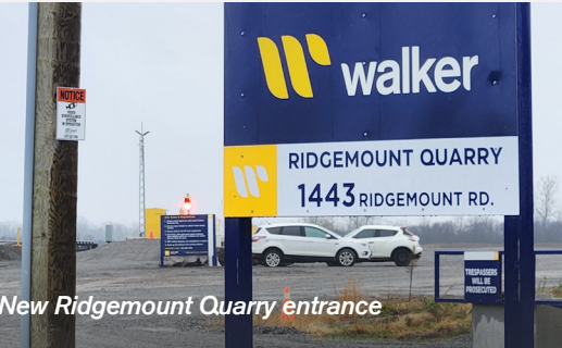
New Ridgemount Quarry entrance