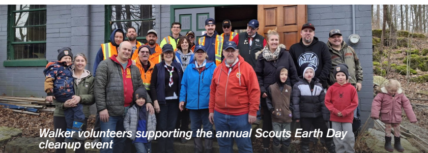
Walker volunteers supporting the annual Scouts Earth Day cleanup event

Our Vineland Quarry and four additional Walker sites are proud to receive the Community Relations Award from the Ontario Stone, Sand & Gravel Association (OSSGA). Walker remains focused on responsible operations where safety is a priority, and noise and dust are monitored according to the high standards of the ministry. Walker also remains committed to supporting the community through donations, event sponsorships and volunteering.