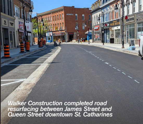
Walker Construction completed road resurfacing between James Street and Queen Street downtown St. Catharines

Walker initiated a project to insulate the dryer drum — a major improvement in lowering energy usage in the production process. This is expected to reduce natural gas consumption by approximately 76,000 cubic meters per year, cutting both energy intensity and greenhouse gas emissions.