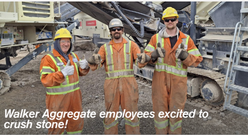
Walker Aggregate employees excited to crush stone!