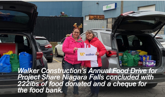
Walker Construction's Annual Food Drive for Project Share Niagara Falls concluded with 222lbs of food donated and a cheque for the food bank.