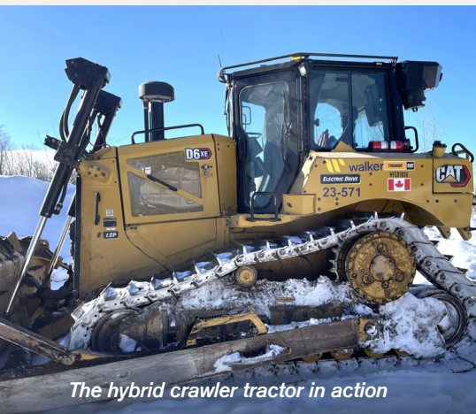
The hybrid crawler tractor in action

This new addition to the Walker Green Fleet initiative is a key step towards achieving our sustainability goals. By optimizing fuel efficiency, it can cut CO 2 emissions by up to 30%.