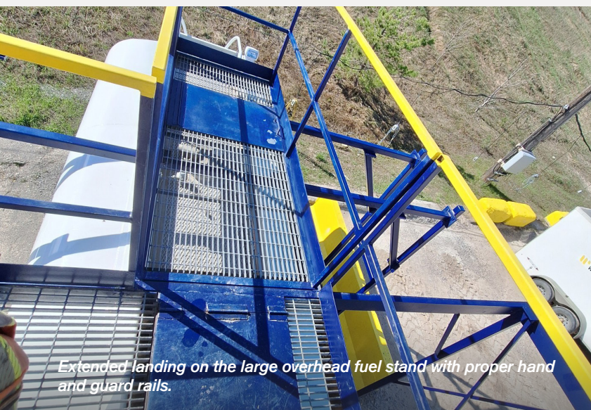
Extended landing on the large overhead fuel stand with proper hand and guard rails.

Shout out to Chris McKnight, Tim Dupuis and the Edgar Pit crew for their proactive approach to ensuring safe work and the goal of continuous improvements on site.