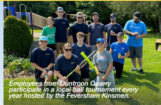
Employees from Duntroon Quarry participate in a local ball tournament every year hosted by the Feversham Kinsmen.

Severn Quarry continues to contribute to the community by sponsoring events and donating to causes like the United Way and Soldiers Memorial Hospital. Severn Quarry also hosts educational events, including tours for local students.