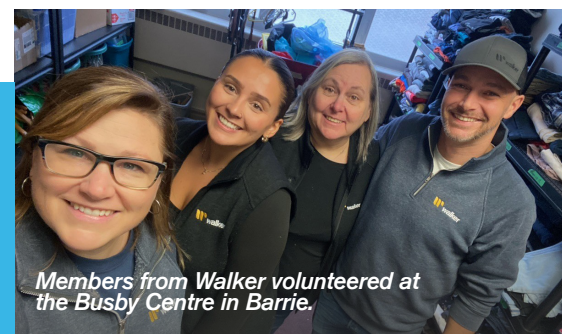
Members from Walker volunteered at the Busby Centre in Barrie.

More than $1.3M was contributed to various local initiatives