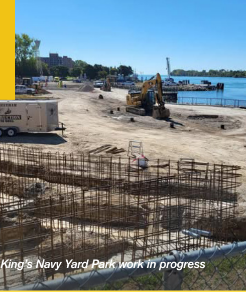
King's Navy Yard Park work in progress

Walker stone is being used for the King's Navy Yard Park expansion and will help improve access to the waterfront and amenities, while providing a space for residents and tourists to enjoy. This project is ongoing until Fall 2026.