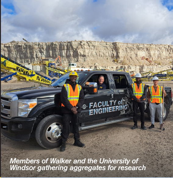
Members of Walker and the University of Windsor gathering aggregates for research