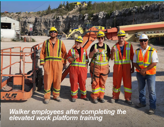
Walker employees after completing the elevated work platform training