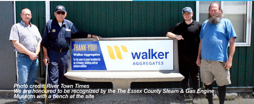
We are honoured to be recognized by the The Essex County Steam & Gas Engine Museum with a bench at the site