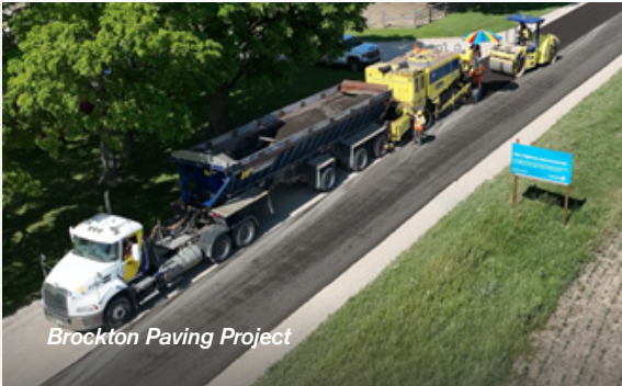
Brockton Paving Project

Walker Construction in Niagara and Grey Bruce, along with Walker Emulsions, collaborated on a paving project in Brockton earlier this year. The team repurposed a recycled asphalt pavement pile and blended it with a mixing grade asphalt emulsion, supplied by Walker Emulsions, to place the 75mm compacted base on County Rd. This Cold Recycled Mix cured for approximately 6 weeks, until a Hot Mix Asphalt surface mix was applied as the final layer.