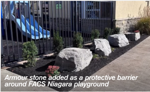
Armour stone added as a protective barrier around FACS Niagara playground

Walker donated armour stone to Family and Children's Services Niagara to act as a safety barrier around their playground. A big thanks to Rynberk Landscape Contractors for picking up and installing the stones. They did a beautiful job adding plants and mulch while ensuring playground safety.