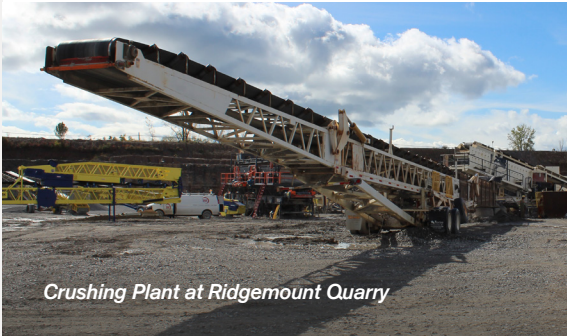
Crushing Plant at Ridgemount Quarry

Walker completed its first full year of crushing at Ridgemount Quarry - shoutout to the team on this exciting milestone! This portable plant provides flexibility to move processing closer to the area that the stone is being extracted from and helps reduce truck traffic within the site.