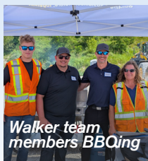
Walker team members BBQing

Thank you to everyone who came out to our Duntroon and Severn Quarry BBQ to learn about the work we do. We enjoyed connecting with each of you and hope you enjoyed the food, touch-a-truck display, and behind-the-scenes tour.