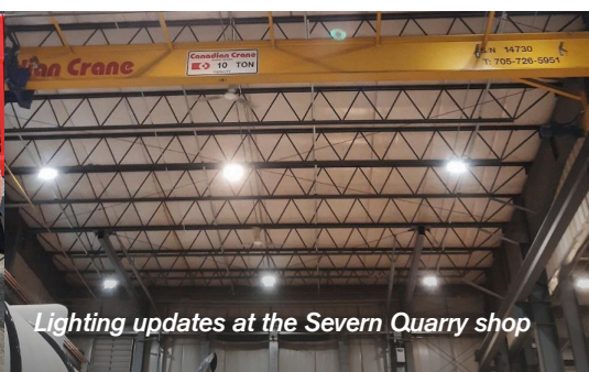
Lighting updates at the Severn Quarry shop

Walker proudly donates to local food banks in our operating areas. Food banks that received Walker support in 2025 include: